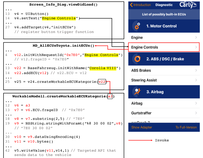
Fig. 3: A motivating running example illustrating the generation of a CAN Bus command in a dongle app.

Precise identification of the generation path. For car companion apps, there is neither standard guidance nor unified